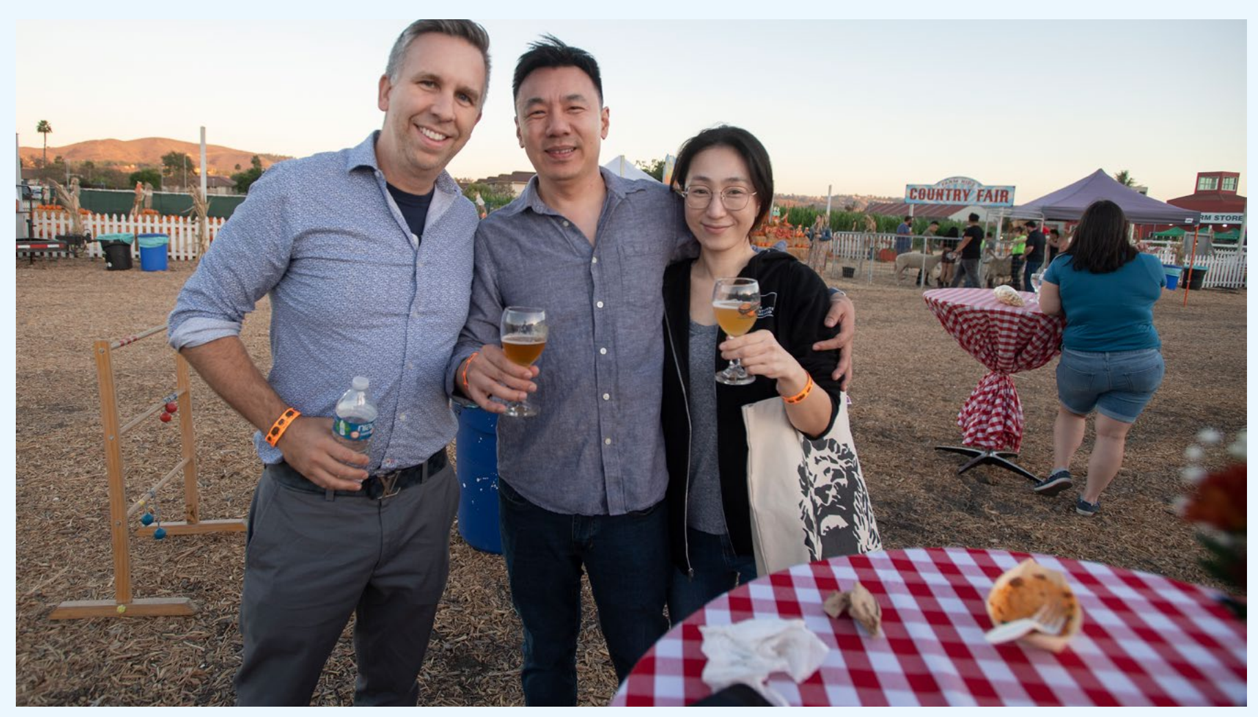
VISIT THIS YEAR'S PUMPKIN FEST PREVIEW NIGHT SEE PG. 4