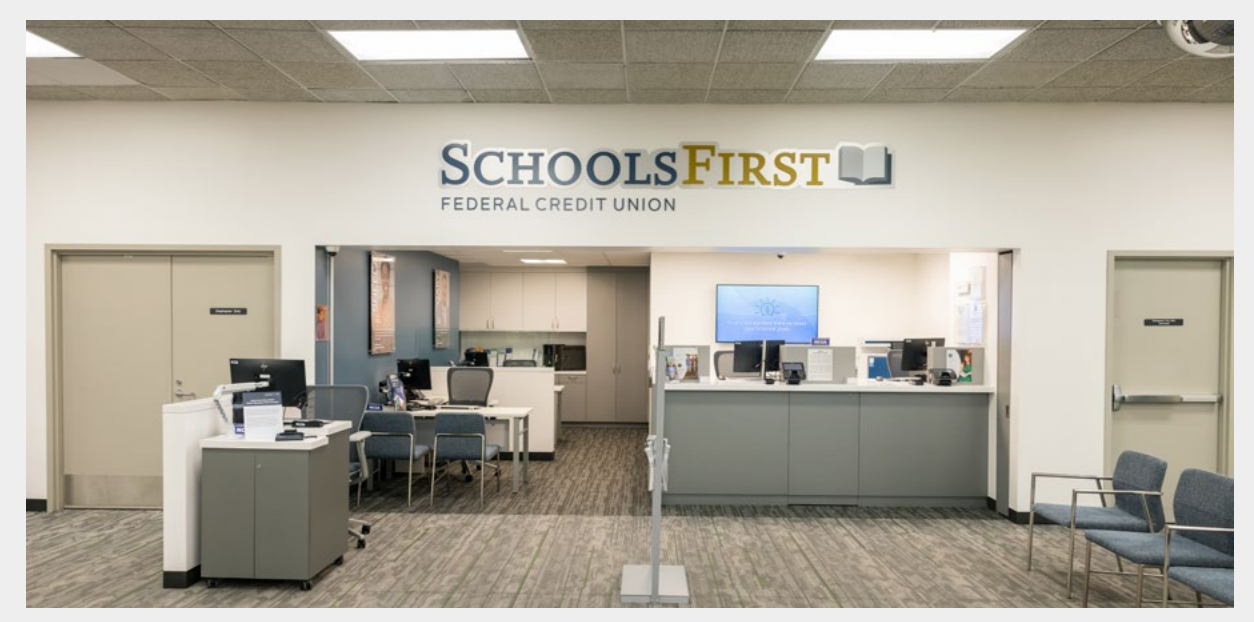
Join us October 1 for SchoolsFirst FCU CPP Branch ribbon cutting day!

*Located on the second floor of the Bronco Bookstore.